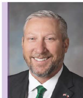
State Senator Drew Springer Senate District 30